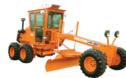
685B Motor Grader