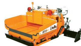
8515 Asphalt Paver